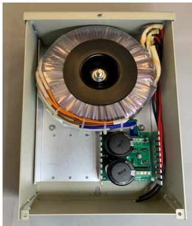
Our power supply can perfectly fit into this wall mount box.