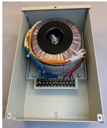
A transformer mounting tray is included for easy installation